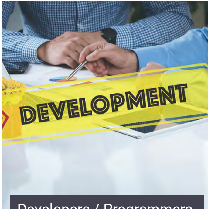
Developers / Programmers

The MJ Accelerator Program provides Resident Experts as additional resources to help your startup accel! Professionals such as Legal & Accounting is also available