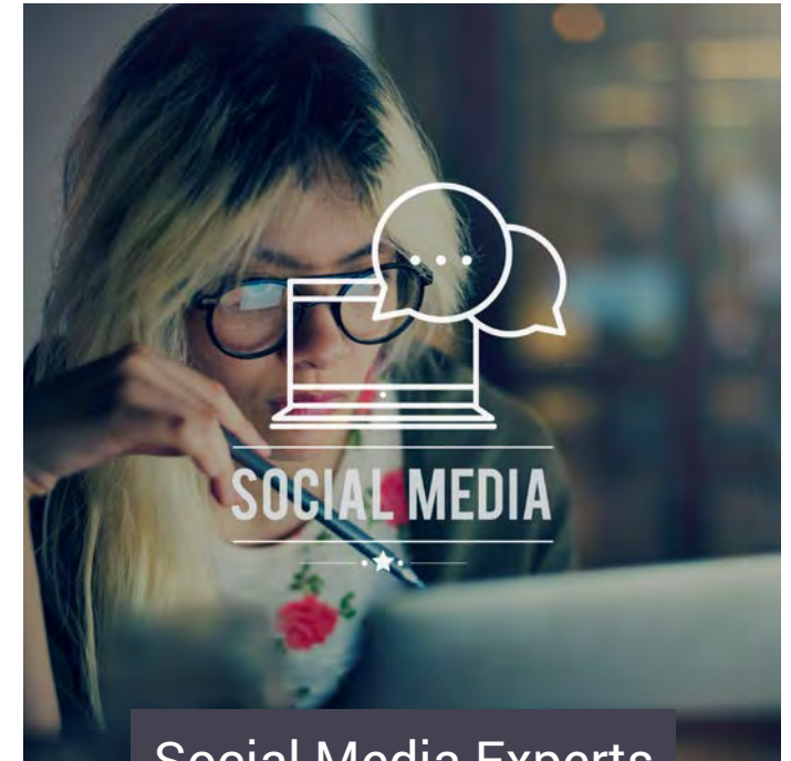
Social Media Experts